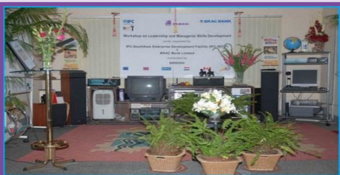
Training Room -Front View