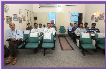
Participants of edotco group.

A Strong leader must have the capacity & skills to anticipate, identify, solve, prevent & learn from problems that occur of work.