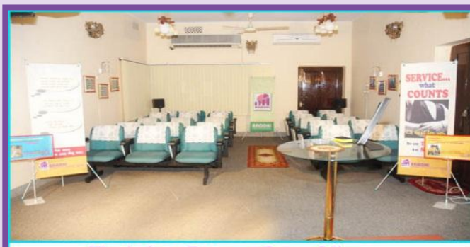
Training Room-Rear View